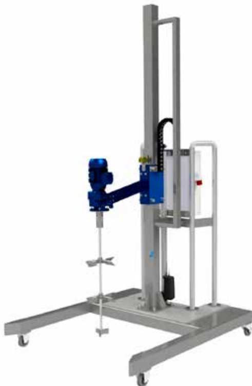
Mobile Mixing Station