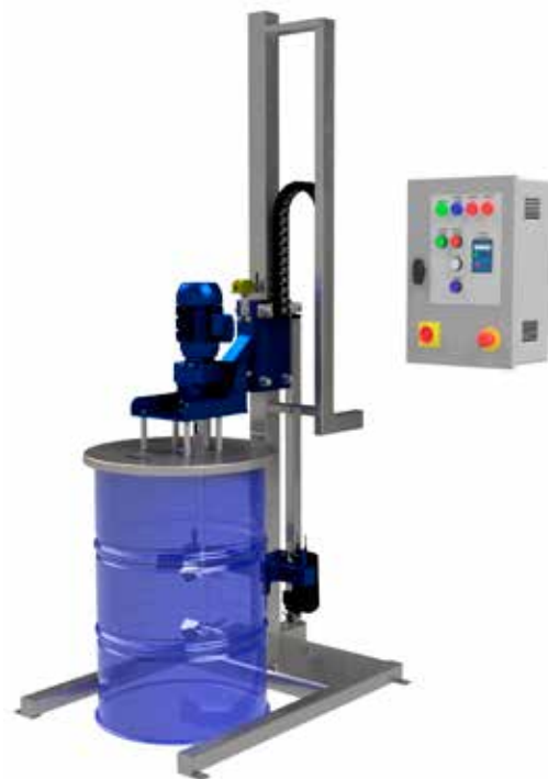
Drum Mixing Station